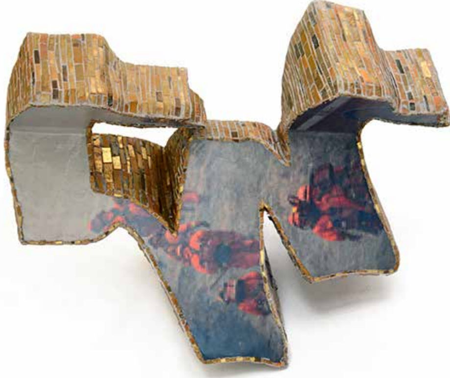
Image V: Fate Needs No Rudders , 2011, leather, enamel, polymer, acrylic, 43" x 38"

Image IV: Air Quality Control , 2014, papier-mâché, acrylic, ink jet print, enamel, epoxy, 25" x 16" x 15"