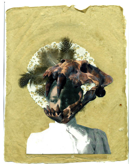
Krista Franklin, We Wear the Mask VIII , Mixed media collage on handmade paper, 2014, Image courtesy of the artist